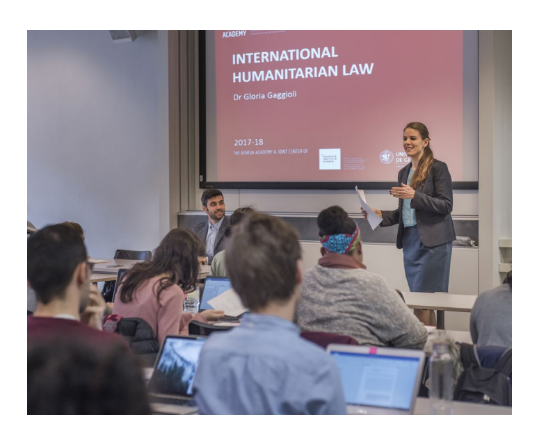
GENEVA ACADEMY OF INTERNATIONAL HUMANITARIAN LAW AND HUMAN RIGHTS

The LLM is also profoundly committed to developing the transferable skills necessary to succeed in the professional world and take up responsibilities in the humanitarian and human rights fields. To this end, internships with leading actors, participation in moot courts and public pleadings, extracurricular activities and a study trip provide a solid exposure to practical work and allow students to expand their network.