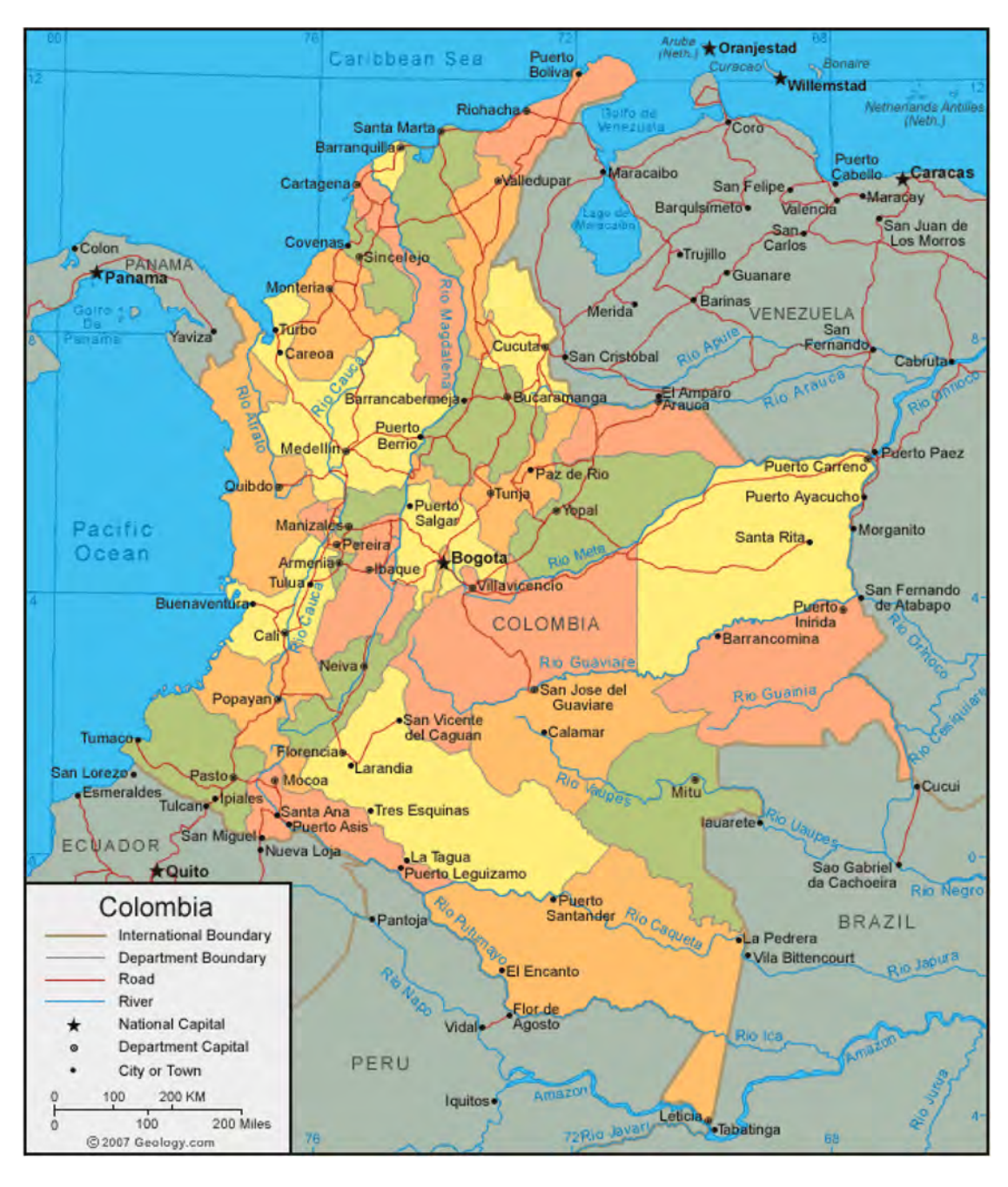
Available online at https://geology.com/world/colombia-satellite-image.shtml