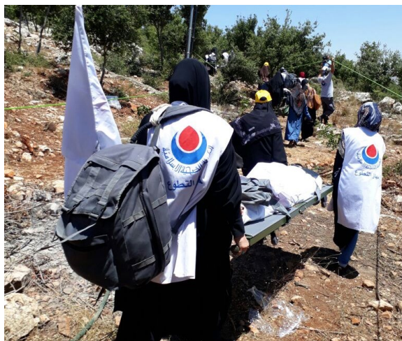
Female Islamic Health Commission (IHC) members wearing the IHC emblem during a field ambulance manoeuvre. The blue crescent symbolizing Islam appears to contain a drop of blood in reference to medical services. 245

Similarly, Hezbollah's involvement in the Syrian conflict required further strengthening of its medical structures, resulting in the creation of highly equipped 246 mobile field hospitals which accompanied the Mujahideen as they proceeded. 247 On the other hand, services provided by the military medical aid were also offered to enemy soldiers 248 and civilians: 'We used to treat them with humanity despite their beliefs and different affiliations; this is our religion and these are our morals'. 249 To confirm this stance, Nasrallah clarified that 'it was [Hezbollah's] ambulances that transported the Qusayr fighters' wounded [meaning Syrian opposition fighters] and brought