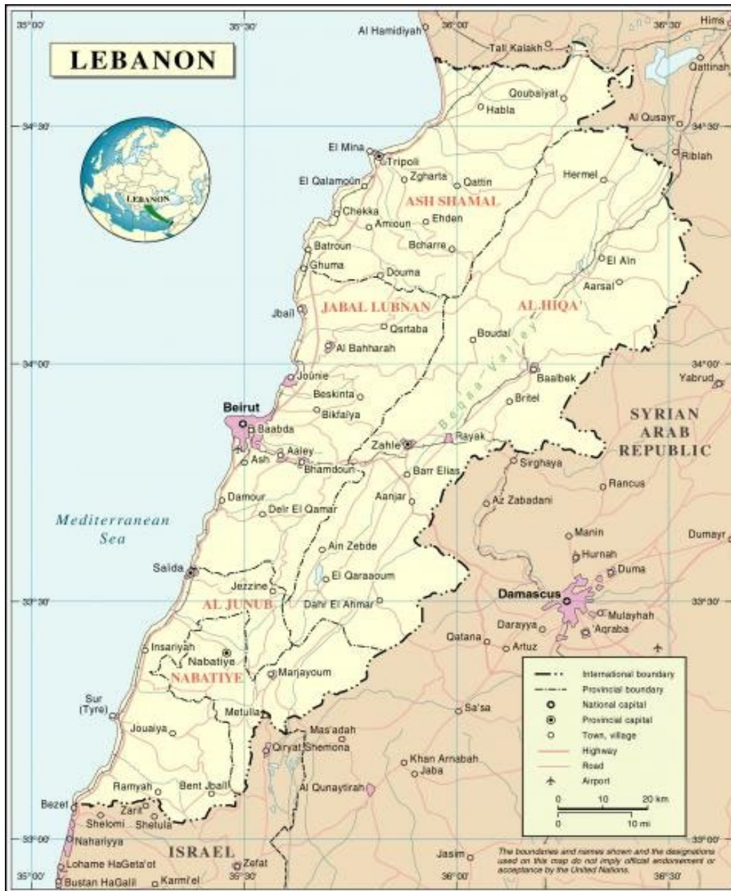
Map of Lebanon