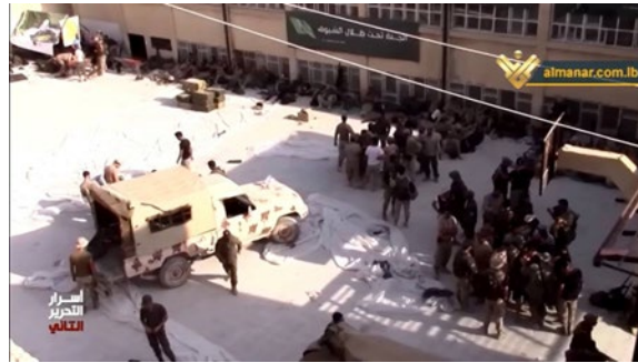
A school used by Hezbollah forces as a gathering centre in Lebanon. 214

its headquarters, rendering it subject to attack as a legitimate military objective both under IHL and Islamic rules of war.