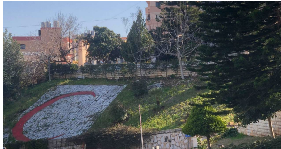
Use of the Red Crescent emblem in Hezbollah's Sheikh Ragheb Harb Hospital in South Lebanon.

them to Lebanon'. 250 This move was praised by the political analyst of an overtly anti-Hezbollah newspaper, who admitted that Hezbollah had acted 'upon moral and religious grounds'. 251